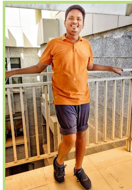
“Defying all odds”

My doctor asked me to start with physiotherapy training regains what I had lost. That is when I got to know about rehab center, from a friend. Within the 1.5 months of vigorous rehabilitation with the dedicated Rehab team, I was back on my feet. After I complete all the 3 cycles of rehabilitation, now I am able to walk to the market, ride my bike and car. The rehab team members there had made me aware about my condition and now I use that information to spread awareness to the ignorant. I am glad that I defied all odds and am living my life to the fullest. Truly, I have gained back everything I lost, after that tragedy only with rehab center.”