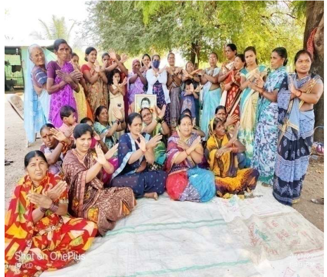
Celebration of IWD at Kolhar RHC of "Mahila Bachat Gat"