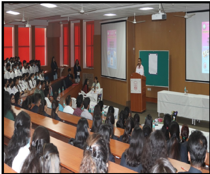
World Café by College of Physiotherapy