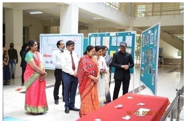
An art exhibition & Wall of fame Organized by RDC