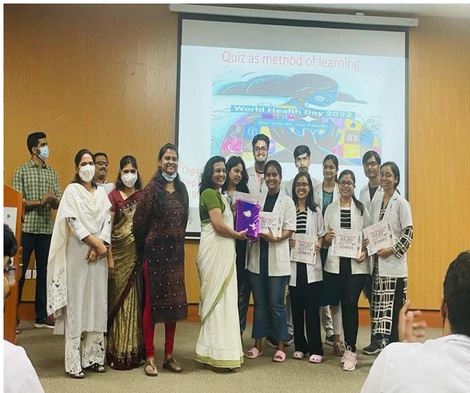
Video Making Competition was organized by RMC