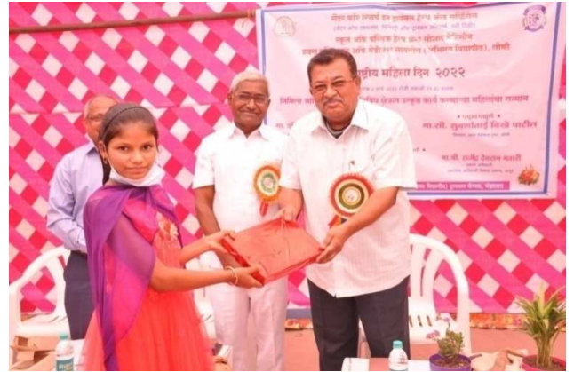
Distribution of Notebook to female students of Tribal School, Shendi