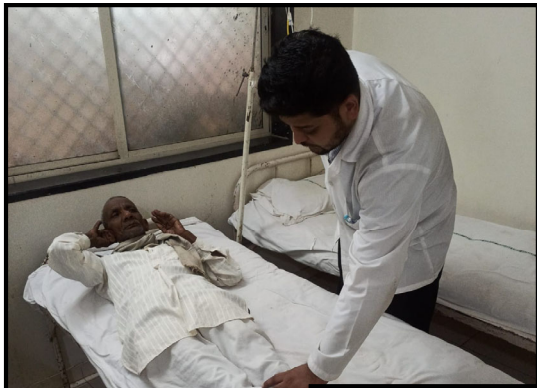
Rajur, Maharashtra, India GVCC+XHR, Rajur, Maharas Lat 19.522203° Long 73.871321° 23/08/24 11:23 AM GMT +0