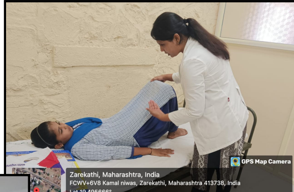
Zarekathi, Maharashtra, India FCWV+6V8 Kamal niwas, Zarekathi, Maharashtra 413738, India Lat 19.495666° Long 74.44481° 20/08/24 10:20 AM GMT +0