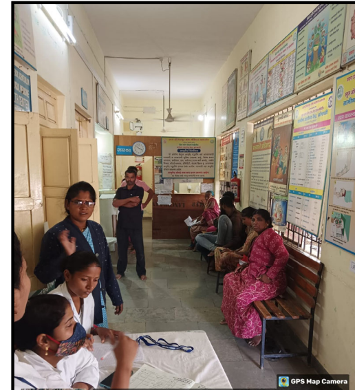
Zarekathi, Maharashtra, India FCWV+QWG, Zarekathi, Maharashtra 413738, India Lat 19.496861° Long 74.44481° 08/08/24 10:20 AM GMT +0