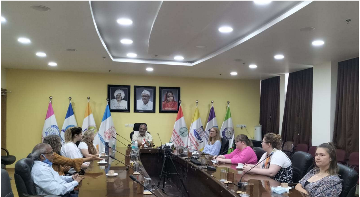
Student and faculty from University of Worcester visit Hon'ble Vice Chancellor Sir