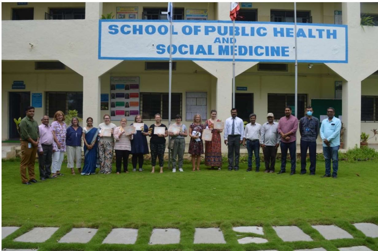
Student from University of Worcester, UK complete the Certificate Course at School of Public Health and Social Medicine, PIMS - DU