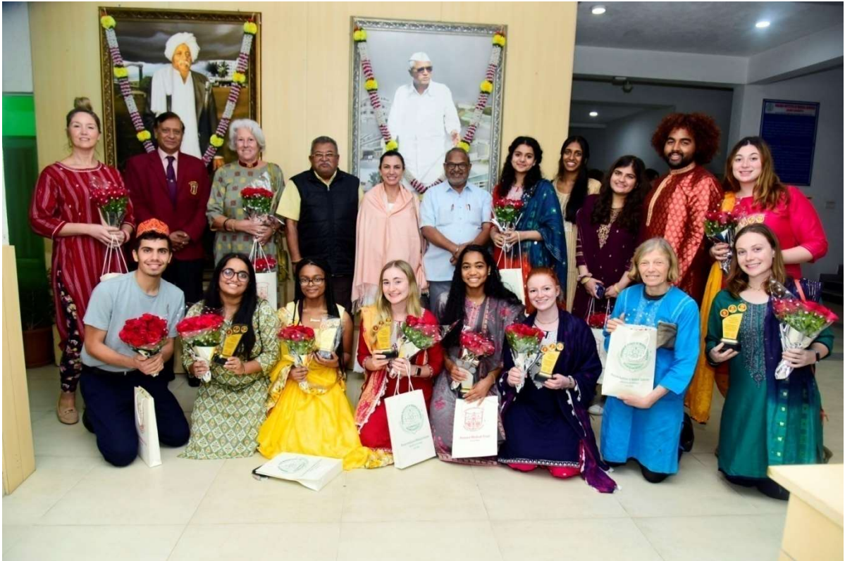
Hon'ble Chancellor & Vice Chancellor with students and faculty from The College of New Jersey, USA Jan 2023