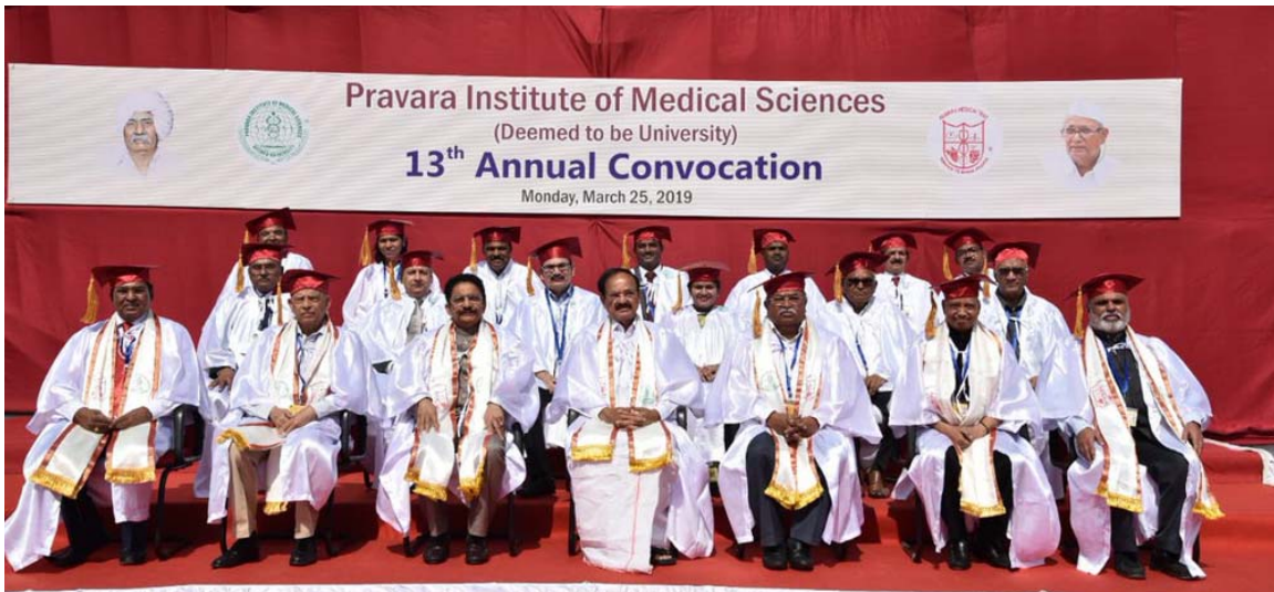
Photo with Board of Management