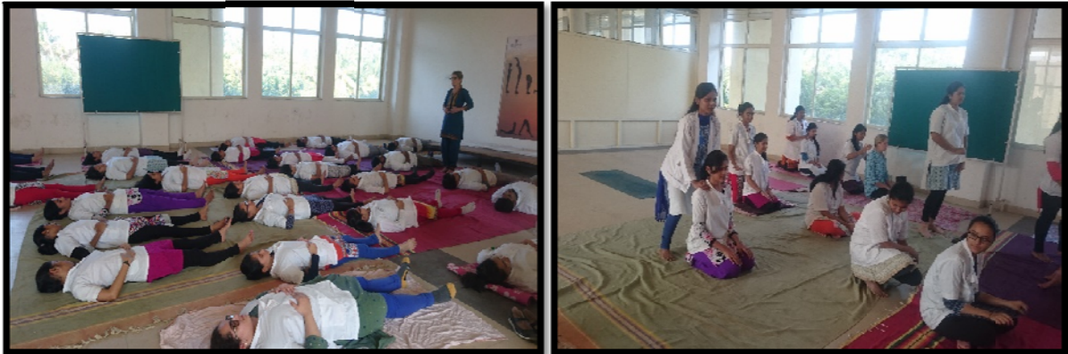
Participants performing activities of Basic Body Awareness Therapy