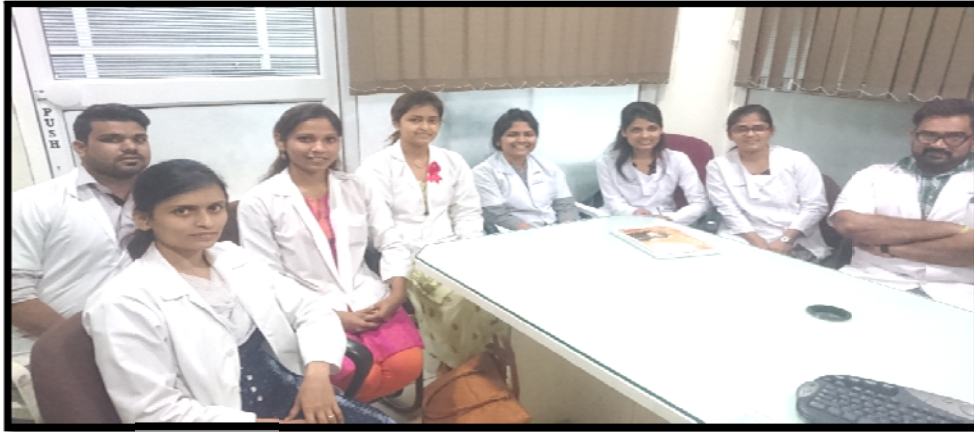
Stroke Awareness Program & Role of Physiotherapy through Tele Rehab through Skype