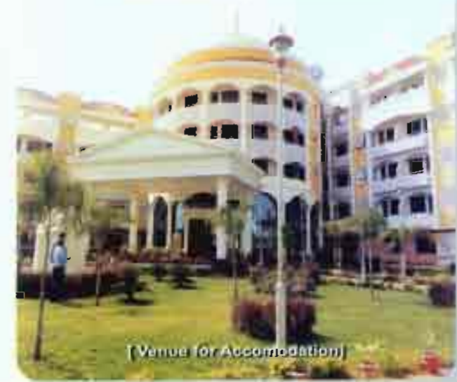
(Venue for Accommodation)