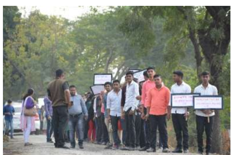
Rally & Home Visits