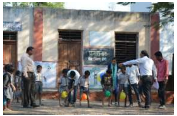
Recreational Sports for School Children