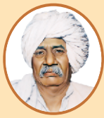
Dr. Vitthalrao Vikhe Patil Padmashri Awardee (1901-1980)