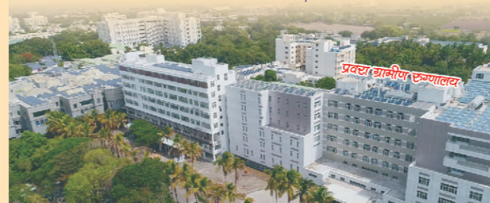
प्रवरा आरोग्य विद्यापीठ