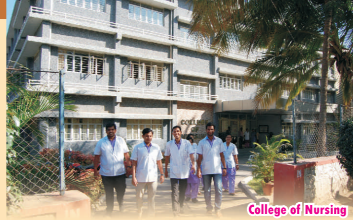
College of Nursing