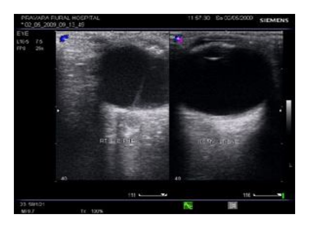
Figure 1: B-scan of both eyes