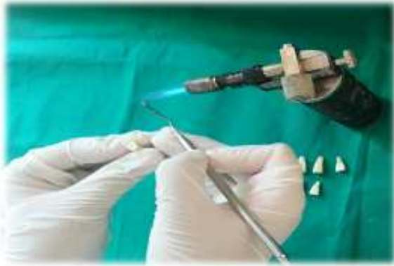
Fig. 4: Removal of coronal 3mm of gutta percha with heated plugger

with the aid of heated plugger ( Fig.4 )and verified with the help of william's periodontal probe( Fig.3 ). Obturated specimens were divided with respect to the intra- orifice barrier material placed over the root canal fillings into the following groups: