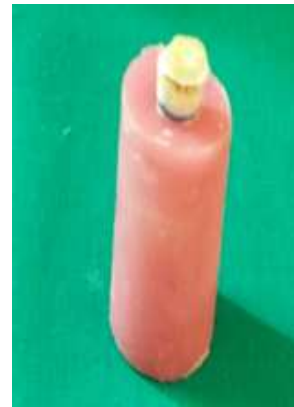
Fig. 5: Specimen embedded in cylindrical acrylic block

The apical root end of each tooth was aligned vertically along their long axis in self-curing acrylic (Quick - Ashvin, Delhi, India) filled in 2cm diameter and 2.5cm height cylindrical polyvinyl tube, leaving 3 mm of each root exposed. ( Fig.5 )Periodontal ligament (PDL) simulation