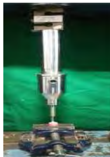
Fig. 6: Specimen mounted in universal testing machine for fracture resistance test

The specimens were mounted on a universal testing machine (Star Testing System, India, Model No. STS 248)and a compressive force was applied at a crosshead speed of 1 mm/min until fracture occurred. ( Fig.6 ) The force