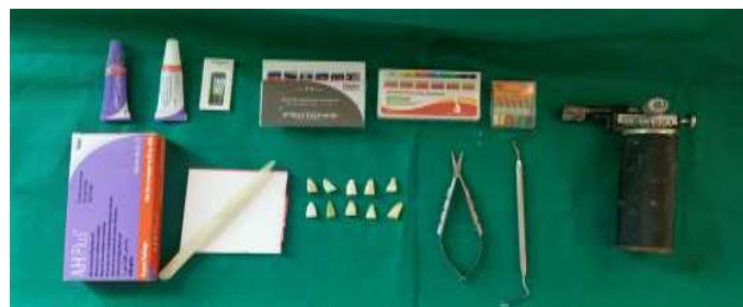
Fig. 2: Armamentarium for instrumentation and obturation of root canals

After determination of the working length, root canals were instrumented with hand ProTaper universal system (Dentsply Maillefer, Ballaigues, Switzerland) in a sequential