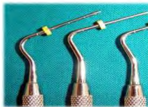
Fig. 3: William's periodontal probe

Except for control group specimens, the coronal 3 mm of root fillings of all other group specimens were removed