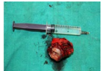
FIGURE 7 showing resected part of ramus of mandible with intraoral growth