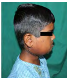
FIGURE 10 showing immediate post-op image of the patient on the 5th day