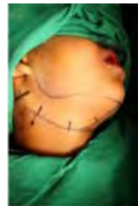
FIGURE 6 showing initial marking of incision which was later on extended for lip-split

FIGURES 4 & 5 showing the CT & CBCT that show the erosion of the ramus of mandible extending upto the sigmoid notch, condyle and coronoid process