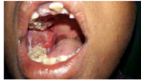
FIGURE 3 showing the intraoral growth

FIGURES 1 & 2 showing pre-op images of the patient with swelling on the right side of the mandible (angle & ramus region)