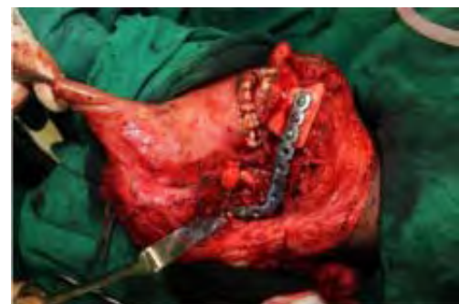
FIGURE 9 showing the application of a Recon plate for primary reconstruction