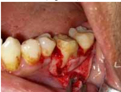
Figure 2 : Evident bone loss seen after flap reflection

Under local anaesthesia, a full thickness flap was reflected from lower left first premolar to second molar. After flap reflection the bony defect was evidently visible. (Figure. 2) With the help of radiograph, a vertical cut was made in the crown towards bifurcation area. After ensuring the cut is complete, mesial part of the tooth was extracted using periosteal elevator and extraction forceps. Complete debridement of the socket was done, all the granulation tissue was removed and socket was irrigated with betadine and saline. It was made sure no sharp tooth margins was bony spicules were left behind. (Figure. 3)