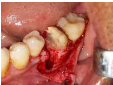
Figure 3 : Removal of mesial fragment

The extraction site was irrigated and flap was repositioned and sutured with 3-0 silk. The distal part of the tooth was reduced to minimise the occlusal forces on it. Patient was recalled 1 week for suture removal and further recalls were performed at one, three and six months to check for satisfactory healing. (Figure. 4) After healing, fixed bridge involving retained distal half and adjacent premolar was planned.