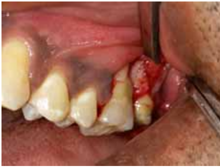
Figure 7 : Removal of Disto-buccal root fragment