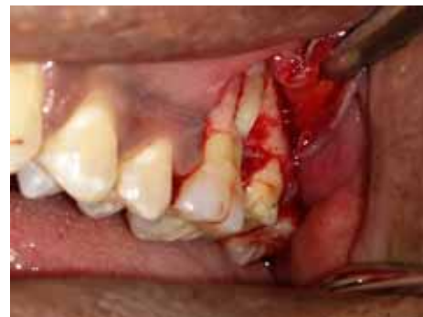
Figure 6 : After flap reflection

Under local anaesthesia, a full thickness flap was reflected from upper right second premolar to second molar. Troughing around the disto-buccal root was done and a slit was made from furcation area so as to cut the root off the tooth. (Figure. 6) After ensuring the root is free from the tooth, a purchase point was made and root piece was elevated and removed using periosteal elevator. (Figure. 7) The cut surface of tooth was smoothed and retrograde GIC (GC fuji IX) was placed. Polishing of the surface was done followed by curettage of the socket. Flap repositioning was done and sutured with 3-0 silk. Patient was recalled 1 week for suture removal and further recalls were performed at one, three and six months to check for satisfactory healing. (Figure. 8)