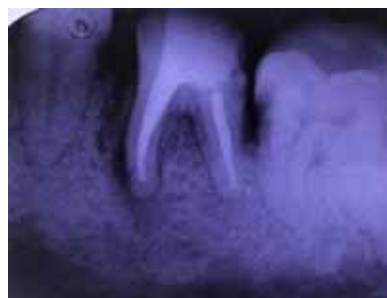
Figure 1 : Pre-operative radiograph

On radiographic examination, severe angular bone loss was evident surrounding the mesial roots leaving furcation intact. (Figure. 1) The bone surrounding the distal root was intact with slight marginal bone loss. Re-treatment procedure was initiated,