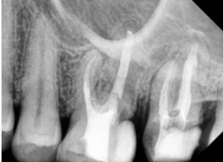
Figure 8 : Post-operative radiograph