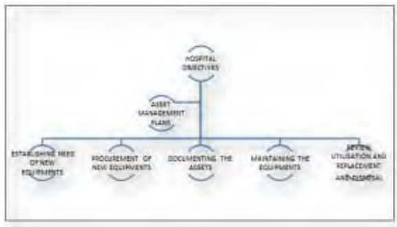
Figure 1: Asset Management Plans