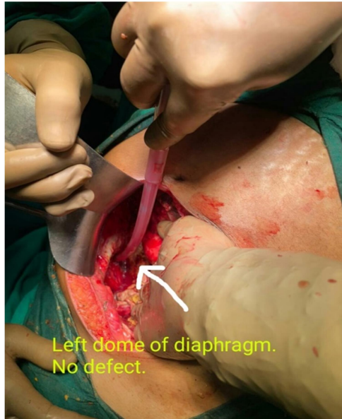
Figure No 2-Intraoperative diaphragm

gangrenous, thin walled (1mm) stomach was seen floating in the peritoneal cavity with no connection to pylorus and duodenum as seen in the figure No. 1