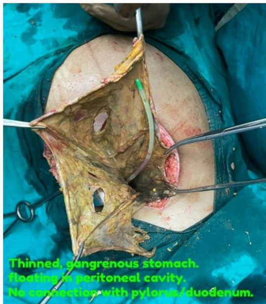
Figure No.1) Thinned, gangrenous stomach

Repeat ultrasound examination (portable done on 19 th August) of abdomen and pelvis was suggestive of moderate ascites with fluid collection in