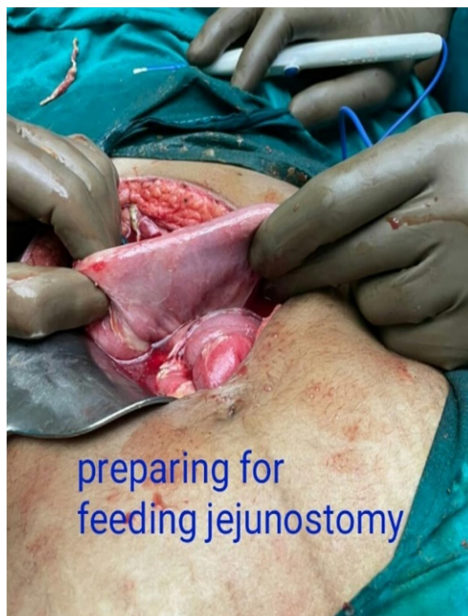
Figure No.4) Preparing for feeding Jejunostomy