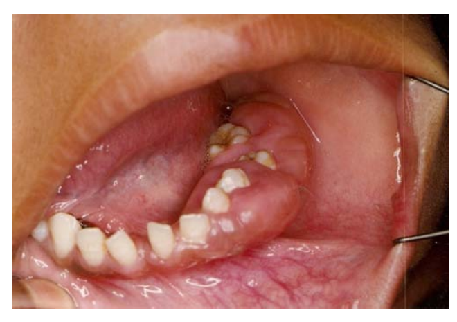
Fig 2: Intraoral photograph showing enlarged gingiva in mandibular arch.

Radiographically crestal bone loss with displacement of teeth could be appreciated. From this clinical and radiographic examination a provisional diagnosis of inflammatory gingival enlargement was made and the patient was subjected to a thorough medical examination. Patient was found to be anemic (Hb 8 gm %)