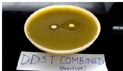
Fig 2: DDST Combined Positive

3) EDTA disc potentiation using cephalosporins: Test organisms were inoculated on Muller Hinton agar as described for the standard disc diffusion test. A filter paper, Whatman no.2 blank disc was placed and then following cephalosporins-Ceftazidime, Ceftizoxime, Cefotaxime and cefepime were placed