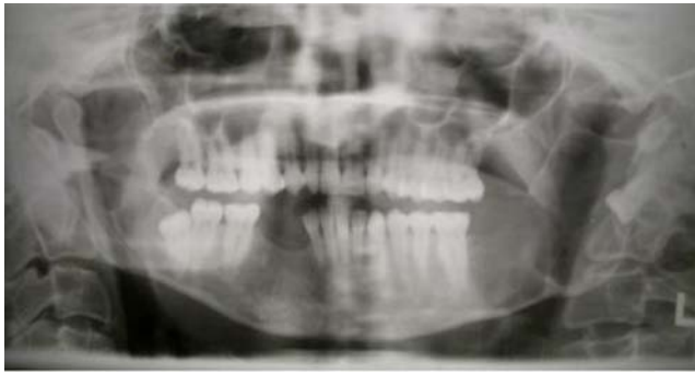
Fig 1 : OPG Showing bilateral well defined radiolucency in the angle, ramus and coronoid process with displaced 3 rd molar on left side

uniform layers of stratified squamous epithelium of 6-8 cells thickness. The luminal surface had flattened parakeratotic epithelium cells, exhibiting wavy surface appearance. The basal cell epithelial layer was composed of palisaded layers of hyper chromatic columnar epithelial cells (Fig 2).