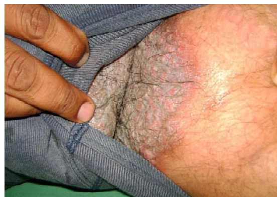
Fig.2: Macerated plaque with painful fissures of the Groin