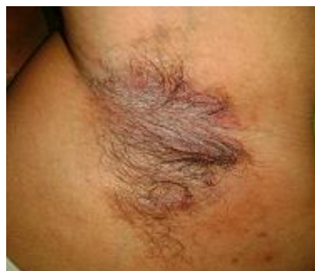
Fig 1: Macerated plaque with painful fissures of the Axilla