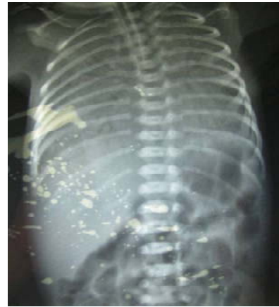
Fig.1: X-Ray chest-showing ground glass appearance of both lung fields before surfactant therapy

The present case shows that the survival of preterm baby with acceptable morbidities is possible in a teaching hospital in rural India, with facilities for advanced neonatal care. Such cases are a stimulant to serve the underprivileged in remote and far flung areas. The baby was born as a preterm due to premature rupture of membranes and had perinatal asphyxia in addition. Respiratory distress due to immaturity of lungs (HMD) was manifested in early hours of life. [3] Surfactant therapy using INSURE technique increased the functional residual capacity of his lungs to restore