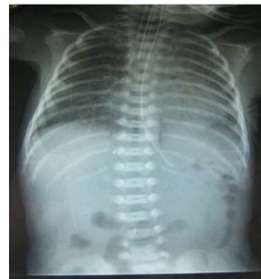
Fig.2:X-Ray chest-showing Clearance of lung fields after surfactant therapy