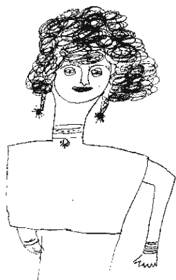
Figure 1: Human Figure Drawing by a patient with mania