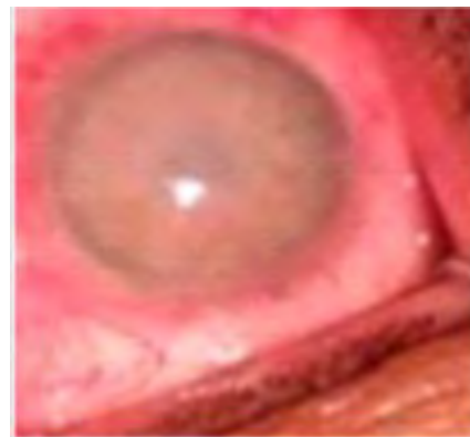
Fig1. Preoperative photo showing corneal haze and cataract.