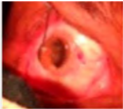
Fig.2 Intraoperative photo showing brown nucleus delivery through CCC.

Preparation of donar corneal button, removal of corneal opacity with trephine, release of iris adhesions at angle and posterior synechie, CCC, removal of nucleus with vectis and needle cystitome, (Fig. 2) implantation of PMMA rigid one piece PCIOL in bag, 2PBIs, intermittent 16- equidistant- radial 10-0 nylon sutures, AC reformation with air and saline, application of BCL, S/C antibiotic steroid injection and postoperative eye patch bandage was given for 24 hours.