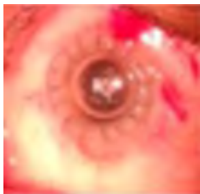
Fig. 3 Post operative photos showing clear graft on 1 st POD

During monthly follow up we recorded UCVA, ARF, and SLE & NCT- IOP.