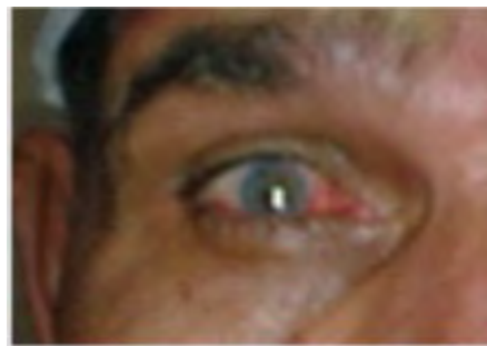
Fig. 5 Post operative photos showing clear grafts after 1 year.