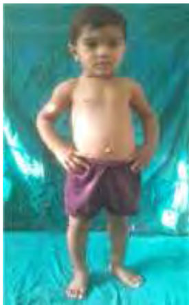
Image : Calf and Thigh Muscle Hypertrophy

Also, she had coarse and dry skin, umbilical hernia, hoarse voice and calf – thigh – gluteal muscle hypertrophy. All the muscles showed firm enlargement with the muscle tone being normal and no weakness (muscle power being 5/5) and deep tendon reflexes were normal. Gower's sign was negative. In presence of features of hypothyroidism, the pseudo hypertrophy of muscles suggested a diagnosis of Kocher-Debre-Semelaigne syndrome.