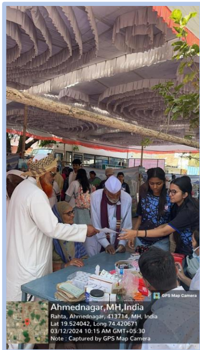
Ahmednagar, MH, India Rahta, Ahmednagar, 413714, MH, India Lat 19.524042, Long 74.420671 03/12/2024 10:15 AM GMT+05:30 Note: Captured by GPS Map Camera