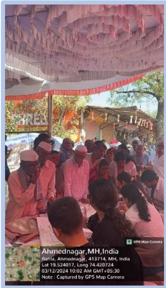
Ahmednagar, MH, India Rahta, Ahmednagar, 413714, MH, India Lat 19.524017, Long 74.420724 03/12/2024 10:02 AM GMT+05:30 Note: Captured by GPS Map Camera