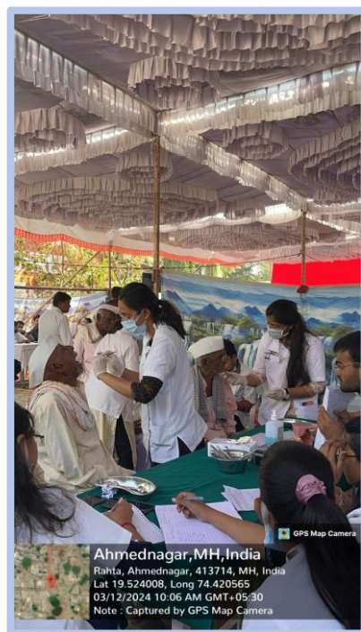
Ahmednagar, MH, India Rahta, Ahmednagar, 413714, MH, India Lat 19.524008, Long 74.420565 03/12/2024 10:06 AM GMT+05:30 Note: Captured by GPS Map Camera