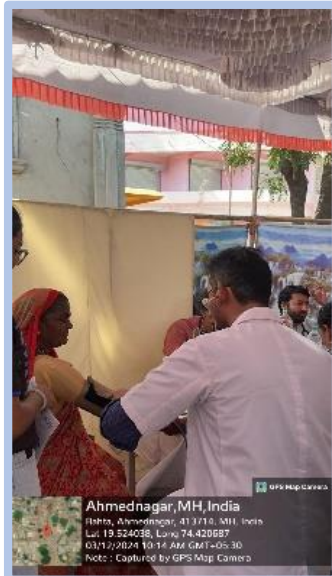
Ahmednagar, MH, India Rahta, Ahmednagar, 413710, MH, India Lat 19.524038, Long 74.420697 03/12/2024 10:14 AM GMT+05:30