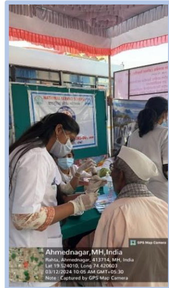
Ahmednagar, MH, India Rahta, Ahmednagar, 413714, MH, India Lat 19.524010, Long 74.420603 03/12/2024 10:05 AM GMT+05:30 Note: Captured by GPS Map Camera