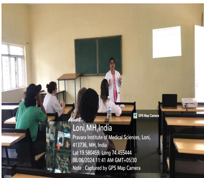
Lecture on Scope of Nursing Research and EBP