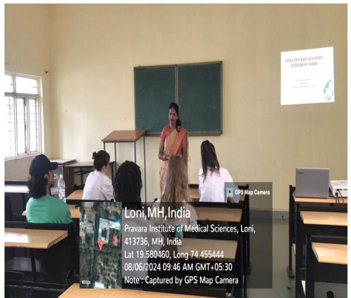
Lecture on Health Care Delivery System in India