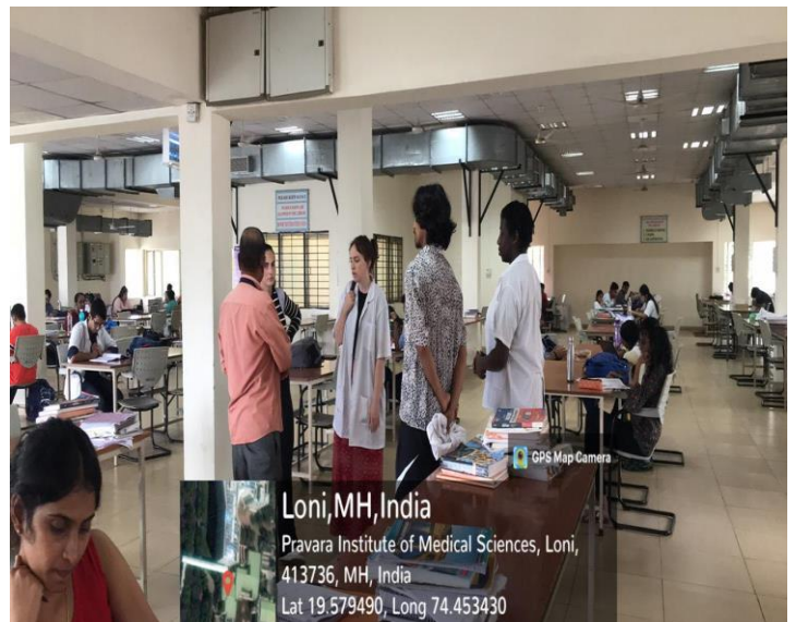
Visit to Central Library Reference Section and Reading Hall