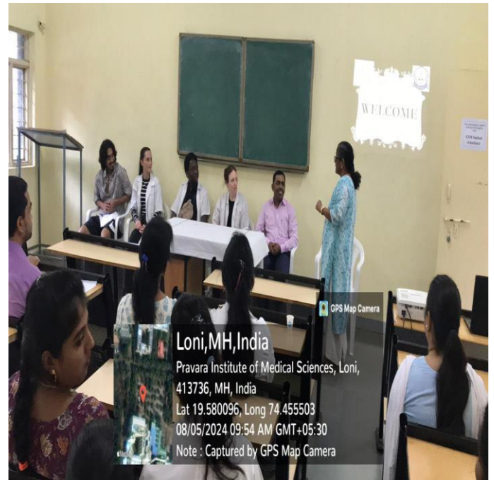
Welcome and overview of SSEVPCON