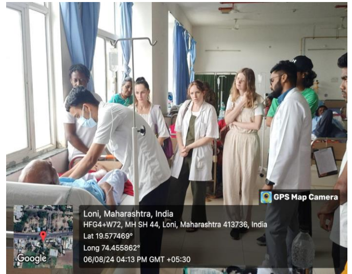
Orientation to Medical Surgical Ward & Case file