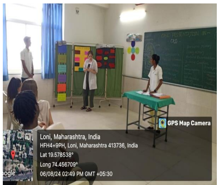
Case Presentation on CKD