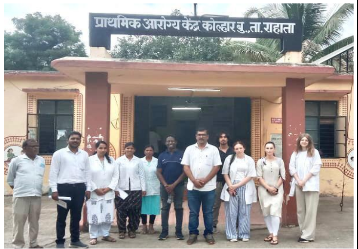
Visit to CHC, Kolhar and Orientation to Child to Child Program